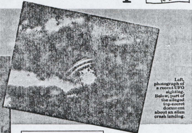
Left, photograph of a recent UFO sighting. Below, part of the alleged top-secret document about an alien crash landing.

Fraud? "People like this would not report these things unless they